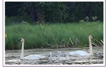
Swans and their babies.

We are in need of volunteers for upcoming activities. If you are interested in volunteering your time and/or equipment please reach out via text (402)515-4557 or email hccacaretaker@gmail.com or hccavolunteer@gmail.com . We look forward to hearing from you.